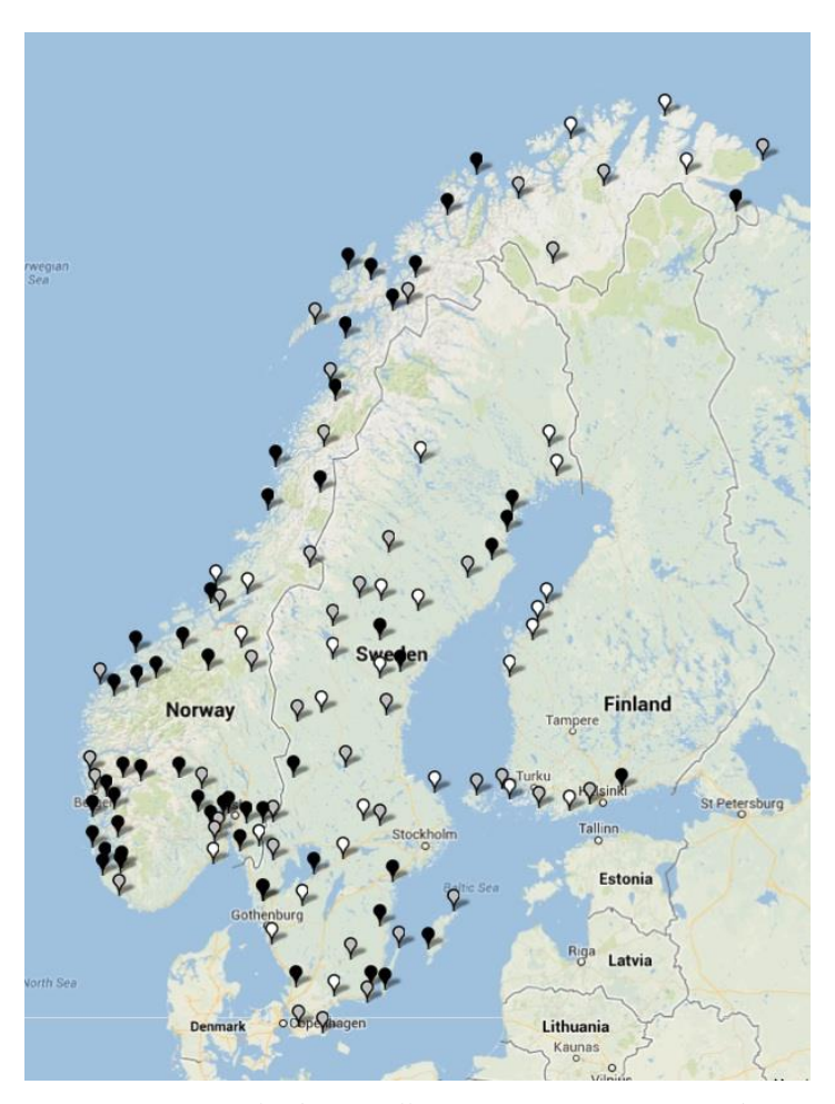
Map 1: Pronominal subjects following negation in a non-subject initial clause.

(#1376: Derfor leste ikke han den. 'Therefore he didn't read it.')