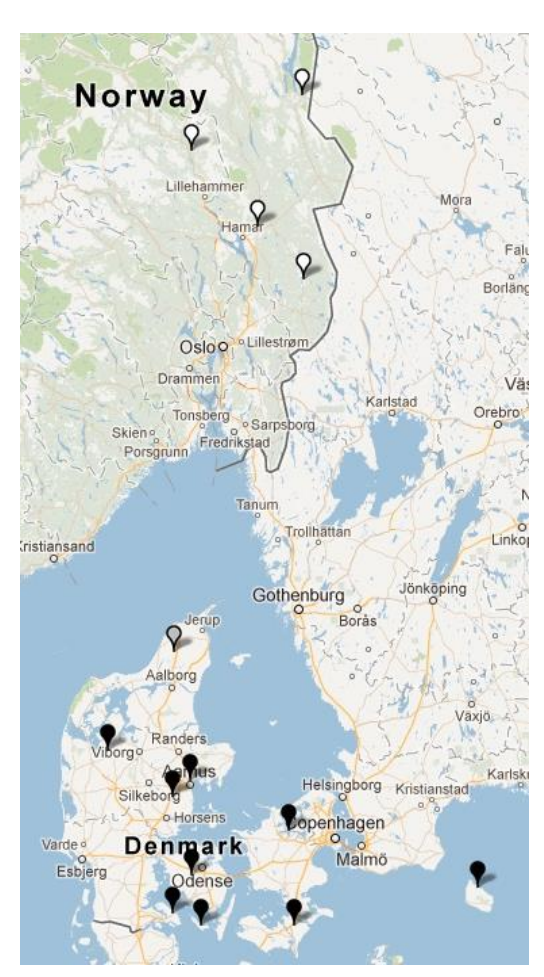
Maps 4-5: Nominal subjects and negation in clauses introduced by maybe without verb movement. Map 4: Nominal subject preceding negation. (#318: Måske Peter ikke kommer.) (#320: Måske ikke Peter kommer.) ('Maybe Peter won't come.')

(White = high score; grey = medium score; black = low score)