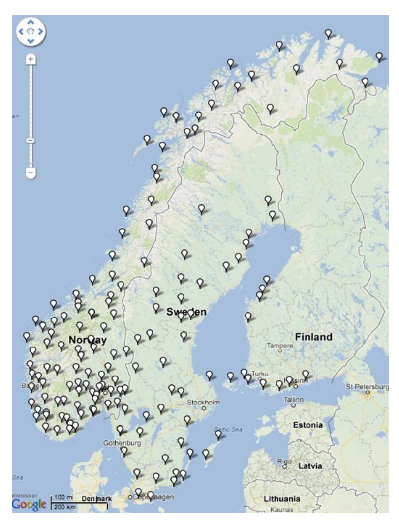
Map 2: Lexical items in the prefield position in subordinate clauses. (#1203: Han ville vite om bussen stopper før motorvegen. 'He wanted to know if the bus stops before the motorway.')